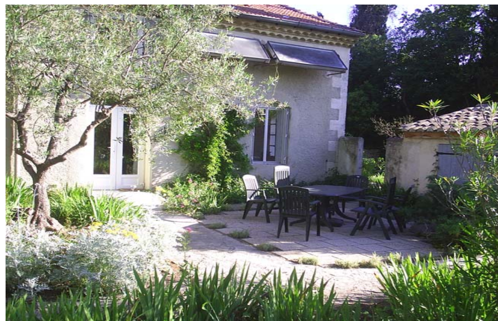
Garden terrace in front of the Meeting room, with ancient cypress trees in background

website: www.maison-quaker-congenies.org